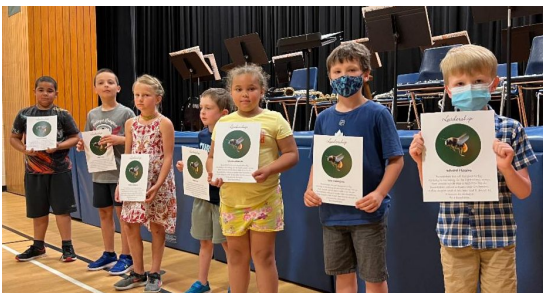
Grades 1 - 4