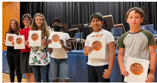
Grades 5 - 8